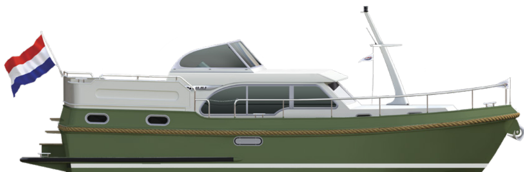
Artists Impression Grand Sturdy 35.0 AC 75 Edition