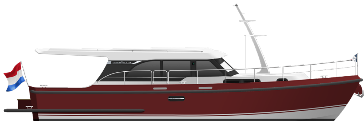
Artists Impression Linssen 40 SL Sedan 75 Edition