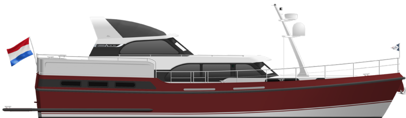
Artists Impression Linssen 50 SL AC Variotop® 75 Edition